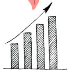
wzrost skuteczności leczenia raka jelita grubego